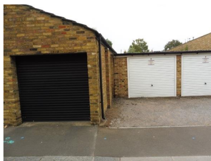
Structure belonging to 18 Byfield Road.