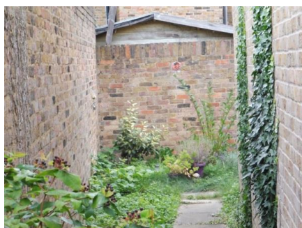
Structure belonging to 16 Byfield Road.

The requirement for adjacent excavation notices is subject to confirmation of the proposed depth and position of excavations and the foundation design of any adjoining properties within 6 metres and confirmation of the depth(s) to which all parts of the new development will extend.