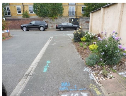
The site of Carrick Close (private road and path).