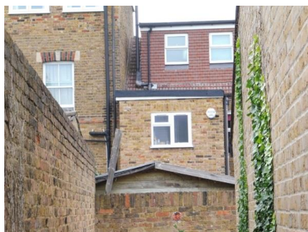
Structure close to north east boundary belonging to 16 Byfield Road.