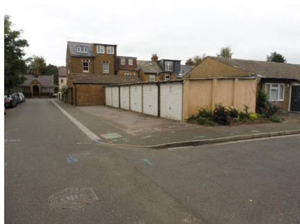
Garage block adjacent 20 Byfield Road.