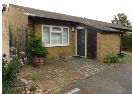
1 Carrick Close.