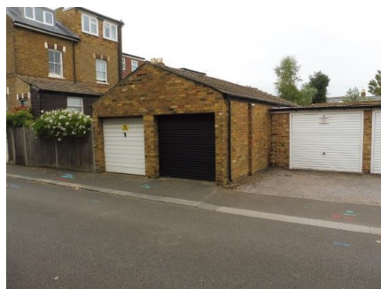
Structure close to north boundary belonging to 18 Byfield Road.